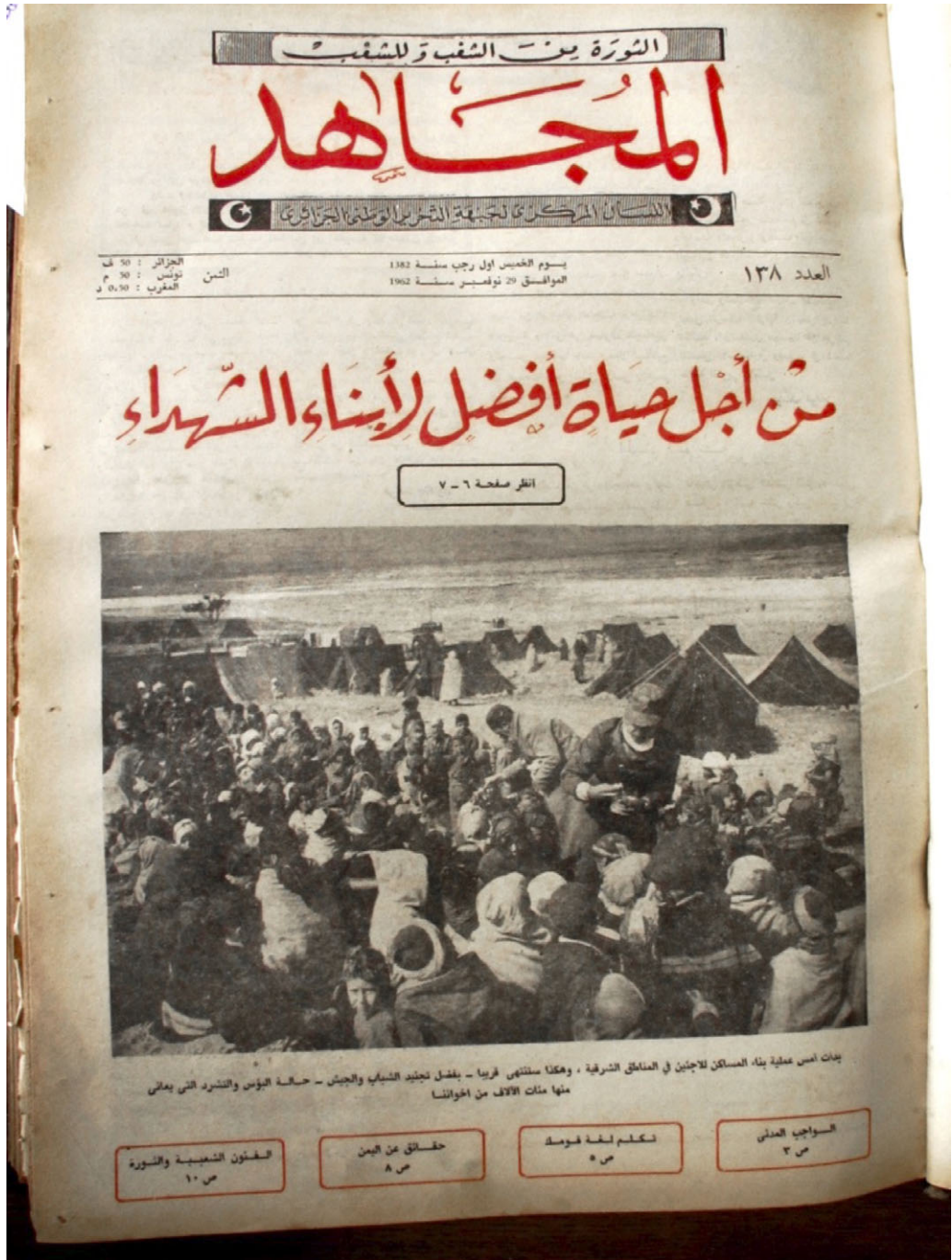
Figure 3. al-Mujāhid , 29 Nov 1962. “For a better life for the children of the Martyrs. Yesterday began the house-building operation for refugees in the Eastern region. And so, thanks to the mobilisation of youth and army, the situation of misery and homelessness that hundreds of thousands of our brothers are suffering will soon come to an end.”