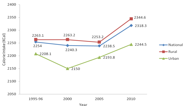
Graph 3. Average per capita per day calorie (Kcal) intake

*Other includes off-farm labor, rickshaw pooler, livestock worker, self-employed, and unemployed for household members with 15 years and older