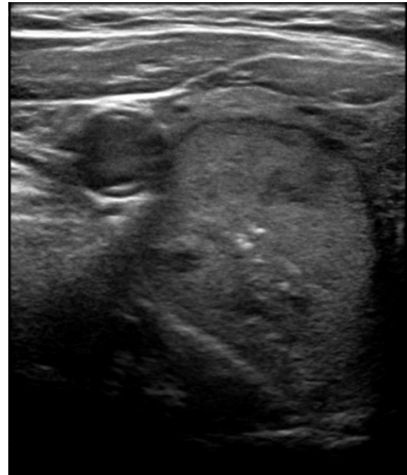
Figure 1. Axial ultrasound image showing a predominantly solid, isoechoic nodule in the right lobe with central punctate echogenic foci which was more difficult to classify using BTA. BTA, British Thyroid Association

simultaneously TR1 with AI-TIRADS and U3 with BTA. These were mixed composition with isoechoic solid elements although two of these had a mural nodule, the margins of which formed an acute angle in relation to the nodule wall. An example is shown in Figure 2. Histology of these three cases was oncocyctic variant papillary carcinoma (one), mixed classical, follicular and columnar variant papillary carcinoma (one) and squamous cell carcinoma (one). A further malignant nodule was graded simultaneously ACR and AI-TIRADS TR3 and BTA U3 but below size limit for FNA with TIRADS, a follicular variant papillary carcinoma while two further cases were graded TR4 with both TIRADS methods and did not meet criteria for FNA or follow-up at 8 and 9 mm diameter. A further malignant nodule graded TR2 with AI-TIRADS was simultaneously graded TR4, for FNA with ACR-TIRADS and U3 with BTA, a papillary carcinoma. With BTA, there was one false negative 11 mm nodule graded U2 but considered TR4 under both TIRADS schemes and thus would have had proposed ultrasound follow-up. This was a papillary carcinoma.