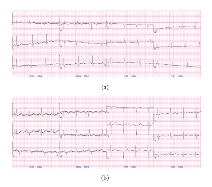
FIGURE 2: Quality of transmitted ECG.