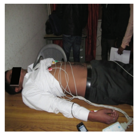
(b) Moderate quality ECG with baseline artifacts