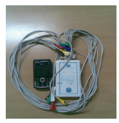
(a) Good quality normal ECG