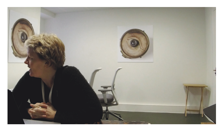
Fig. 19.3 An interview in process. Footage of participants is captured wherever they settle, and the DIY nature of The Diary Room undermines any attempts at controlling composition of the recordings. ( Credit : Kimberley Staines. Background artwork: see Fig. 19.1.)

The questions are about interdisciplinarity and collaboration. Our wish is to test a novel method for gathering self-reflexive data on interdisciplinary collaboration as it happens, by generating a database of participants' thoughts – spontaneous, unpractised – about Hubbub during the course of the project. When we were making our Diary Room, we distinguished between our serious and our banal prompts. But now we're not so sure. It might be that your response to 'What did you have for lunch? Or what are you hoping to have for lunch?' might be just as useful in opening up the dynamics of collaboration as your response to a more self-consciously important enquiry (such as 'Do you think the physical space of the Hub facilitates collaboration?').