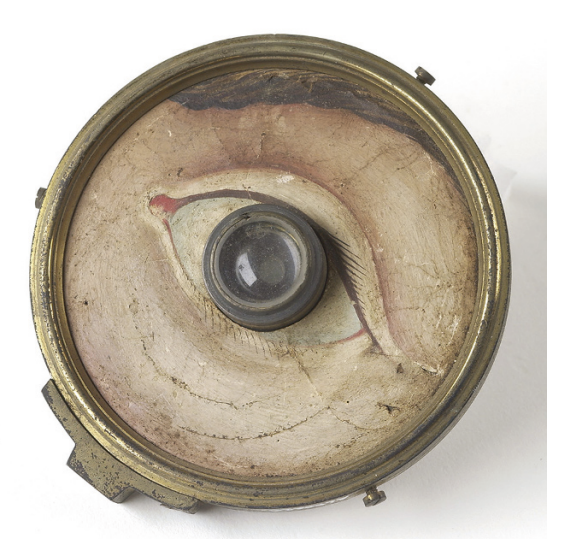
Fig. 19.1 Model eye, glass lens with brass-backed paper front with hand-painted face around eye, by W. and S. Jones, London, 1840–1900.

contoured space for interdisciplinary collaboration, for some time. We would love a few more participants for our experiment that's trying to understand its rhythms, to capture the practices of interdisciplinarity in the making.<sup>2</sup>