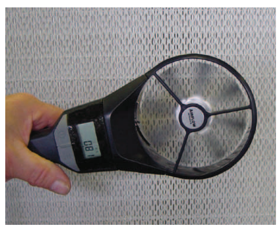
Figure 1 The vane anemometer