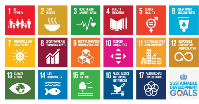
Figure 2: The Sustainable Development Goals