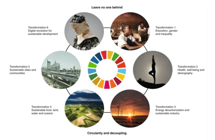
Figure 3: The Six Transformations (Sachs et al. 2019).

transforms resource use, institutions, technologies and social relations to achieve key SDG outcomes" (Fig. 3). Admittedly, there is growing criticism of the SDGs, especially in the context of their overall reliance on the growth and development paradigms. For example, Ben Robra and Peisi Heikkurinen (2019) argue "that sustainable development cannot be based on further economic growth". Nevertheless, the SDGs are based on a global consensus of what is currently perceived as a desirable transformation.