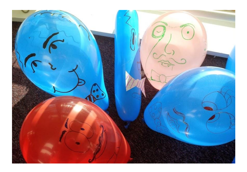
Figure 3. Some Balloon Academy candidates

judgements triggered extensive discussions about inclusion, and impact of additional needs on assessment, as well as gender equality and stereotyping.