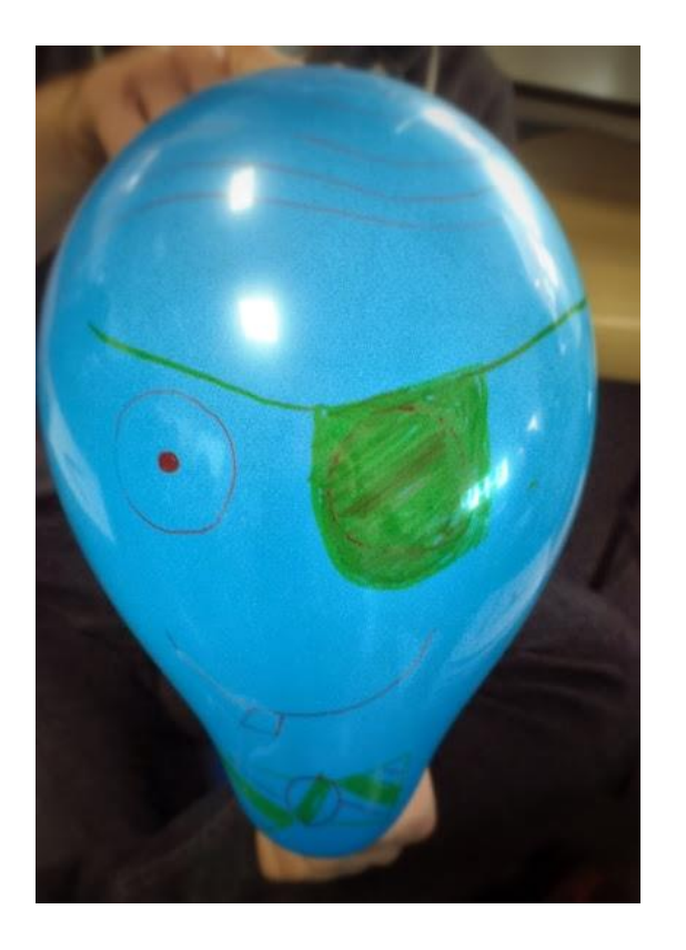
Figure 2. Balloon decorated according to marking criteria

The balloon depicted above (Figure 2) was deemed to fail the Balloon Academy, because it had an eye-patch, contradicting the—initially clear, now clearly vague—instruction of 'eyes'. The judgement led to an intensive classroom discussion, in which the students immediately brought up issues around equality and diversity. The situation became an important teaching moment, addressing issues around disability, concluding this should not impact the student balloon's passing of the Balloon Academy.