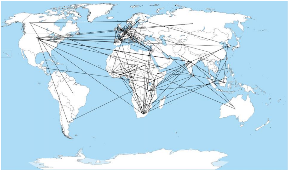
Figure 1. Map of countries included in comparative research on pedagogy