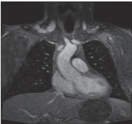
FIGURE 2: MRI of the heart with and without intravenous gadolinium contrast administration.