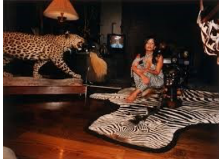
Figure 1. Daniela Rossell Untitled ( Ricas y Famosas ), 1999 C-print 50"x 60"