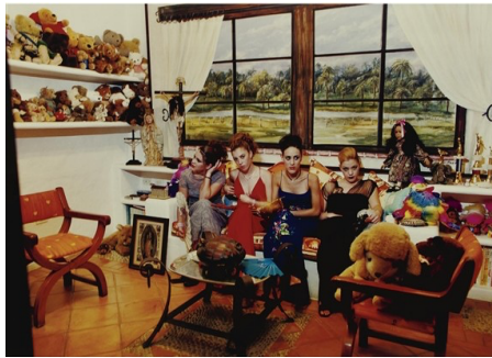
Figure 2. Daniela Rossell Untitled ( Ricas y Famosas ), 1999 C-print 50"x 60"