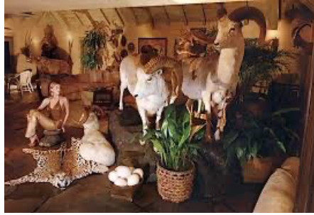
Figure 3. Daniela Rossell Untitled ( Ricas y Famosas ), 1999 C-print 50"x 60"