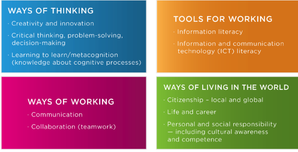
Fig. 2: ATC21s-defined 21st century skills framework (Credit: [21]).