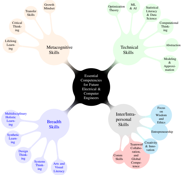
Fig. 4: A Mind Map of the Essential Competencies for Future Electrical & Computer Engineers

In this section, we describe the essential competencies for beyond-2020s future electrical & computer engineers. We have organized them in the following subsections (see Figure 4): (§III-A) metacognitive skills; (§III-B) technical skills; (§III-C) breadth skills; and (§III-D) inter-/intra-personal skills. (We note that we use the term “skills” synonymously as competencies, broadly as an umbrella term that subsumes skills, knowledge, as well as attitudes.)