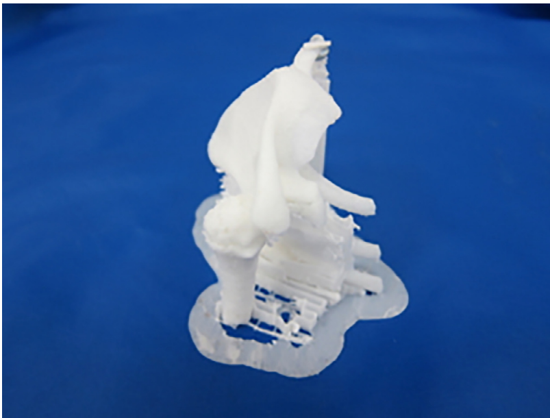
Figure 3. 3D printed, anatomically accurate model (Ultimaker, B.V, Netherlands).