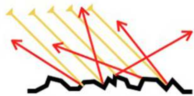
B. Diffuse Reflection (rough surfaces)