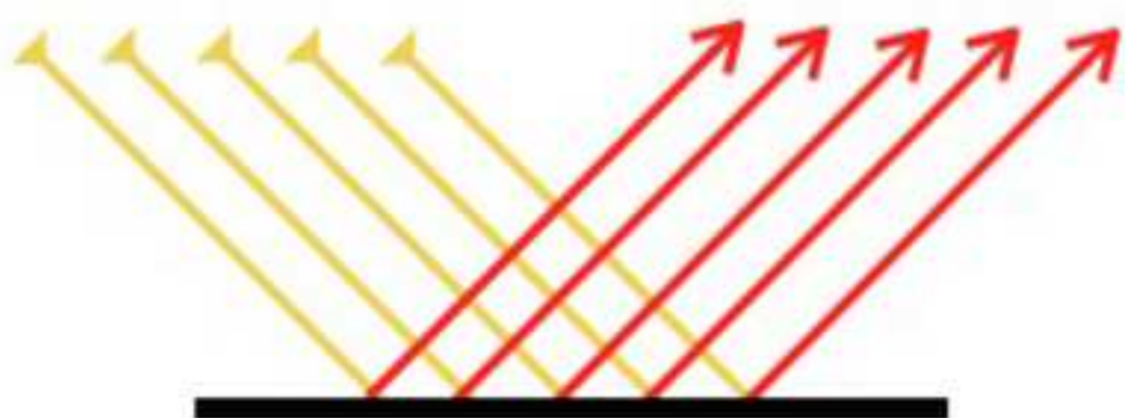
A. Specular Reflection (smooth surfaces)