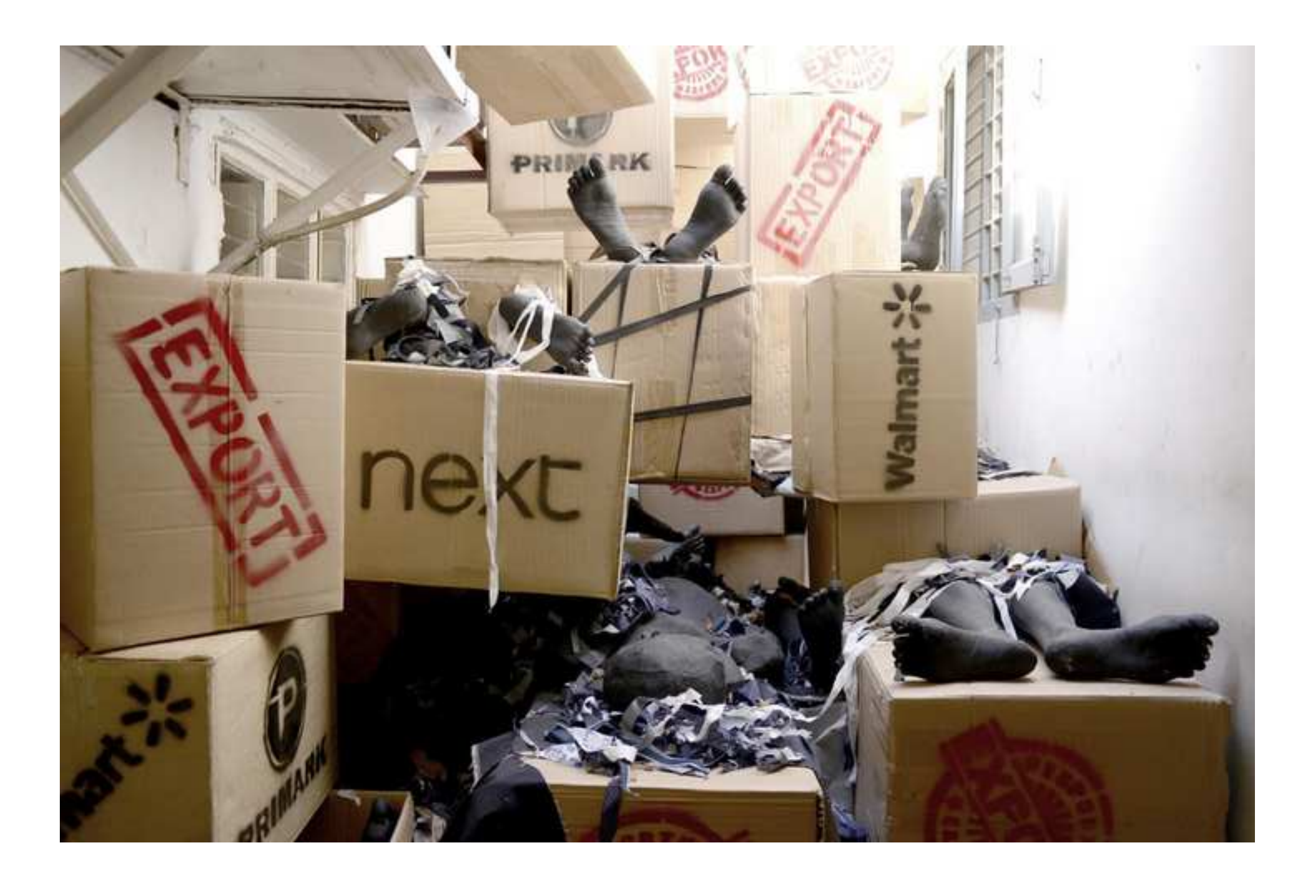
Figure Click here to download high resolution image