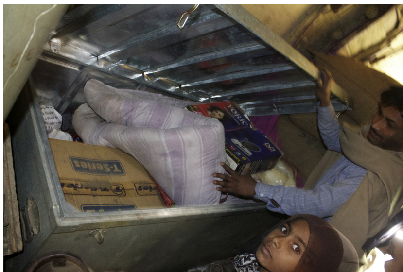
Fig. 3. A television and DVD player stored safely, waiting for the grid to arrive (Photo: Ankit Kumar).

capacity. Opening up solar provision to such improvisation might be one way of ensuring their ongoing access, for “improvisation allows the work of maintenance and repair to go on”, even if the technology changes from its original form ([23]: 4). Enabling users to put solar to work on their own terms appears from across our case-studies to be one critical means through which energy access endures