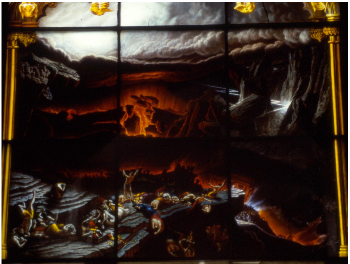
Fig. 6. William Collins, Opening of the Sixth Seal, after Danby, c. 1840, St Andrew's Redbourne.