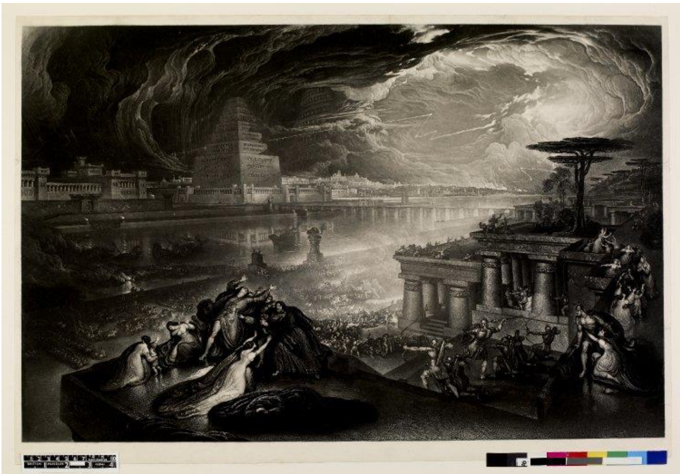
Fig. 4. Fall of Babylon, mezzotint, 1831. British Museum, Mm,10.6