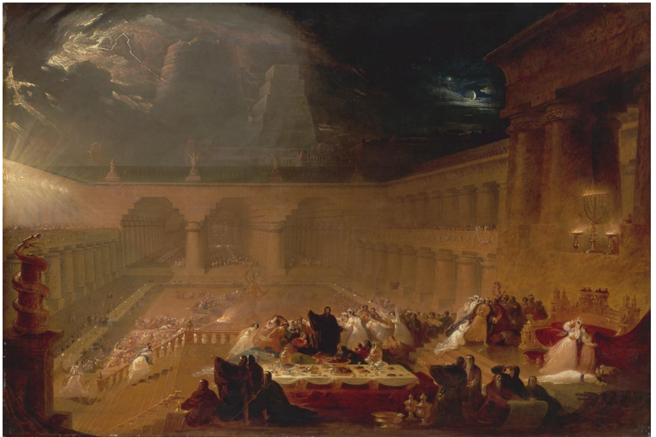
Fig. 2. John Martin, Beshazar's Feast, oil on canvas, 1820. Yale Centre for British Art. Second version, smaller and less red than the first version.