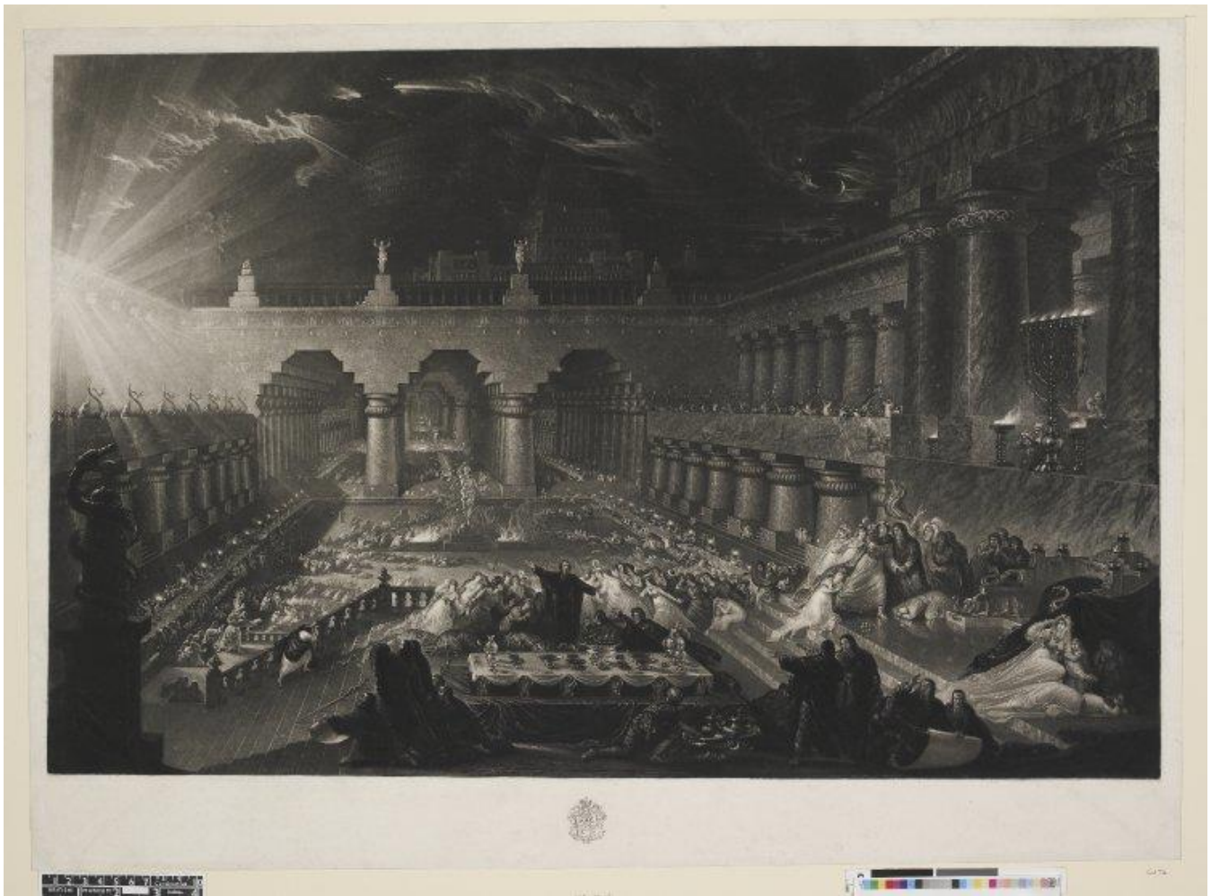
Fig.3 Belshazzar's Feast, mezzotint,1826 British Museum, Mm,10.1