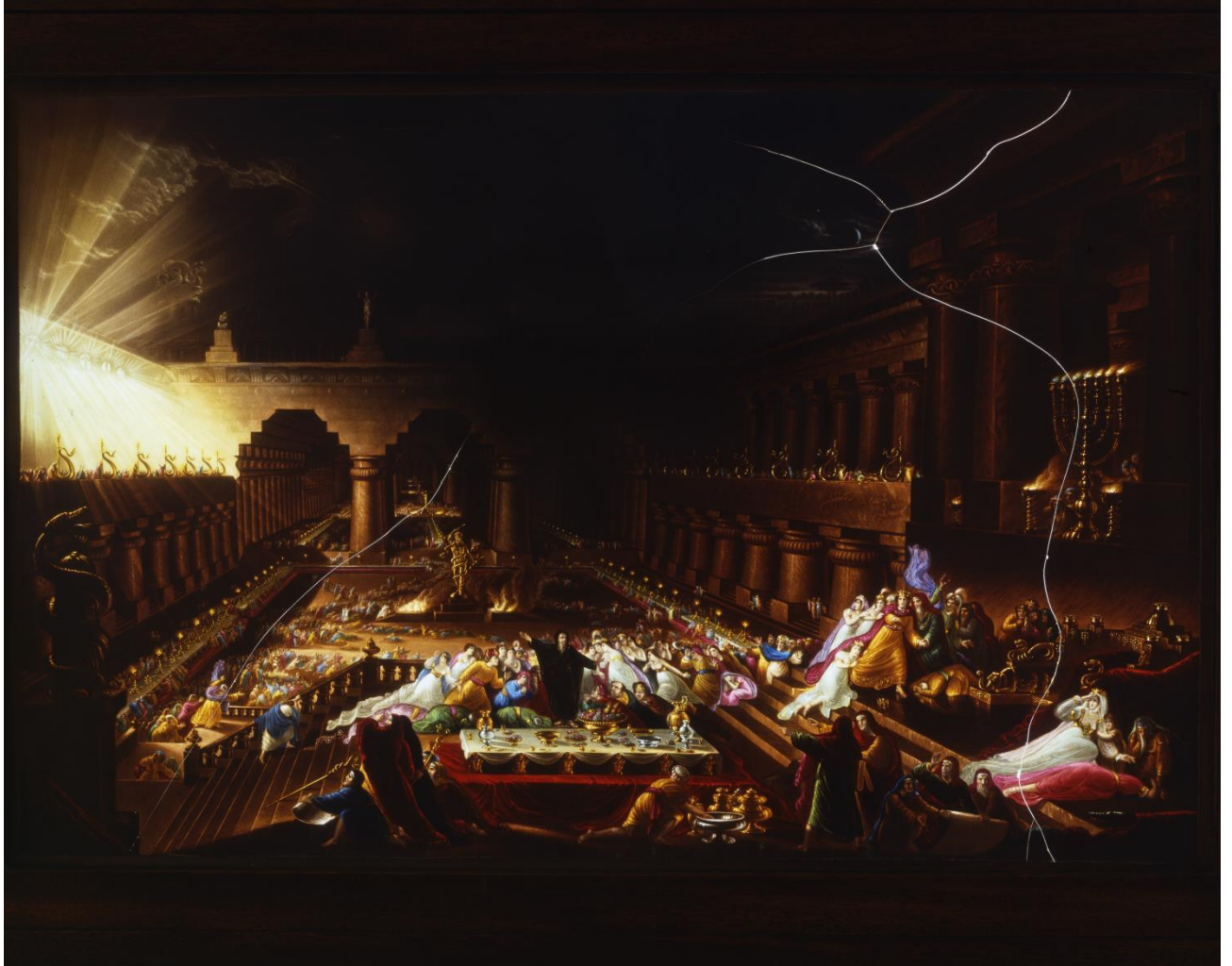
Fig.1. Hoadley & Oldfield, Belshazzar's Feast, after Martin, vitreous enamels and glass stain, 1828. Private Collection, Duke of Northumberland.