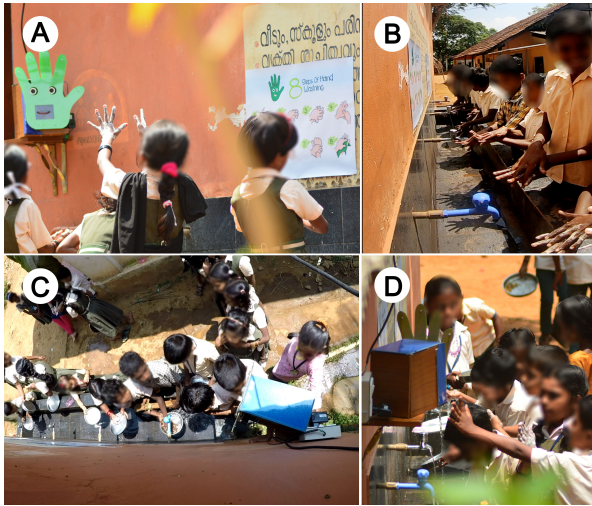
Fig. 2. Robot Interaction - A: Students showing hands to Pepe, B: Group handwashing session, C: Students talking to Pepe, D: Post lunch interaction with Pepe

structures between the adult interviewer and the child, including suggestibility. We followed De Leeuw’s [23] suggestions in designing the surveys for the children.