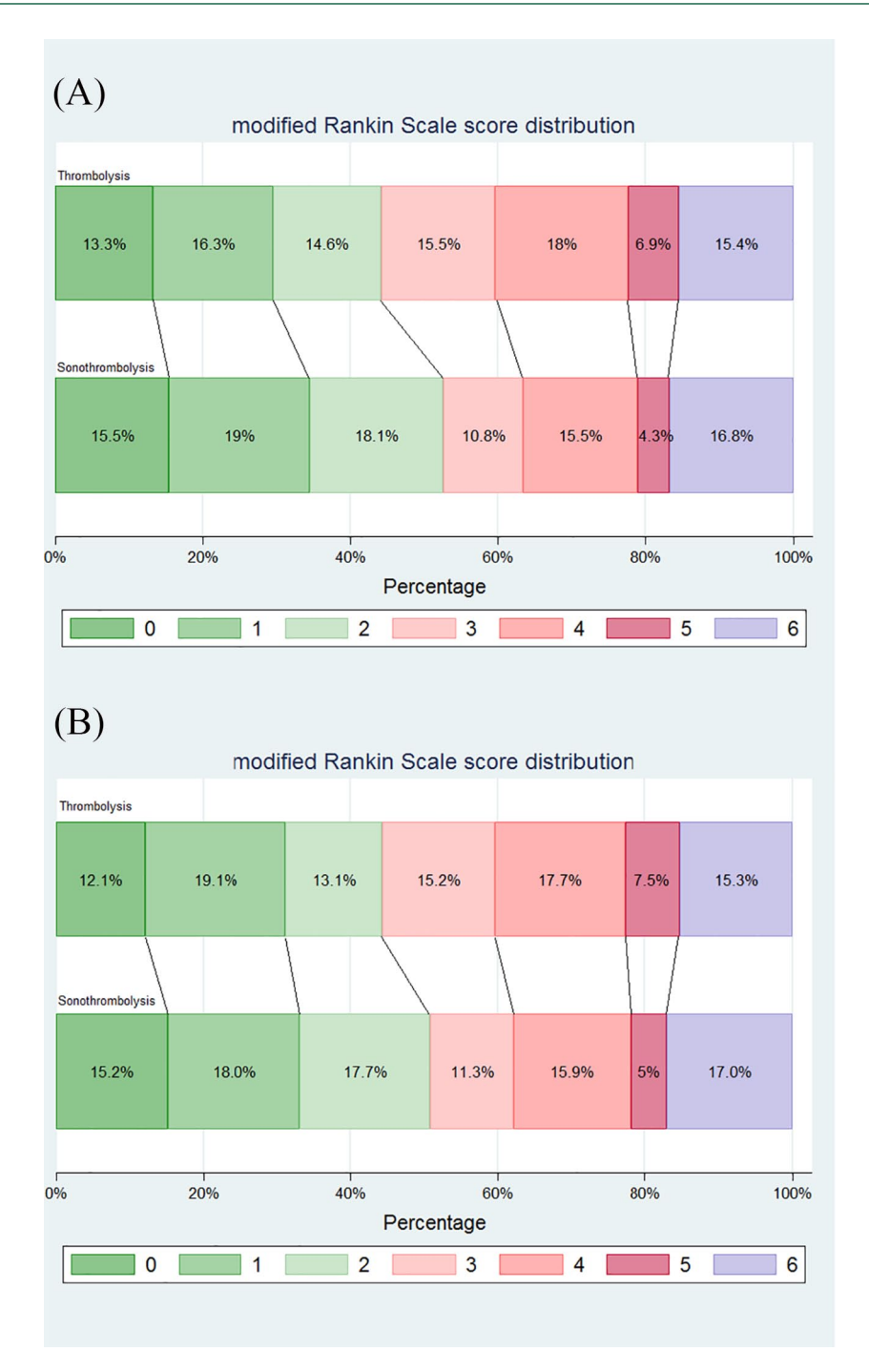
Figure 3. Modified Rankin scale scores at 90 days in the intention-to-treat population that was treated with intravenous thrombolysis within 3 h ('US' primary outcome) after removing centers with perceived endovascular equipoise shift (A). Modified Rankin scale scores at 90 days in the intention-to-treat population that was treated with intravenous thrombolysis within 4.5 h ('Global' primary outcome) after removing centers with perceived endovascular equipoise shift (B).

Shown is the distribution of scores on the modified Rankin scale. Scores range from 0 to 6, with 0 indicating no symptoms, 1 no clinically significant disability, 2 slight disability (patient is able to look after own affairs without assistance, but is unable to carry out all previous activities), 3 moderate disability (patient requires some help, but is able to walk unassisted), 4 moderately severe disability (patient is unable to attend to bodily needs without assistance and unable to walk unassisted), 5 severe disability (patient requires constant nursing care and attention), and 6 death.