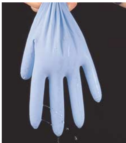
Fig. 1 Water inflation method for puncture detection

with 0.5 litre of water, held up against a dark background and gentle pressure applied at the cuff of the glove whilst observing for punctures during a 20 second period (Fig. 1). The number of punctures was recorded and their position marked on a chart. As control, 200 unused gloves of each type were also inflated by the same method and monitored for defects.