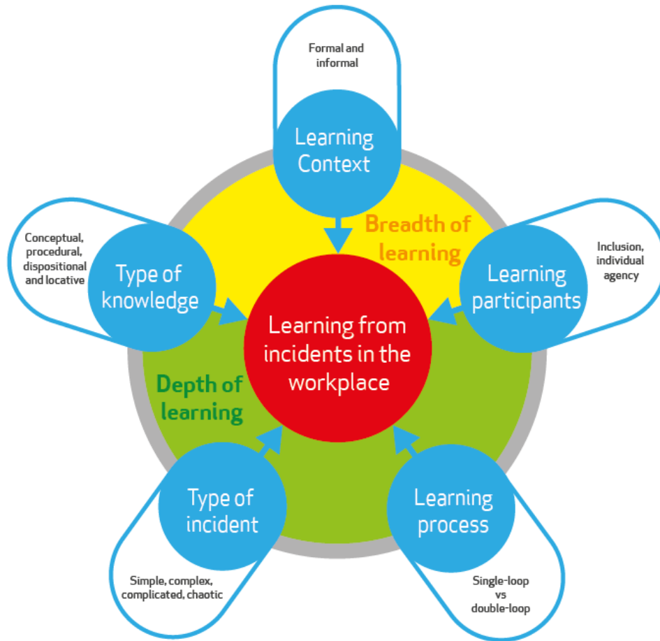
Figure 2. The LFI Framework (Lukic et al., 2012a)

These two perspectives, the temporal and sequential learning phases of the LFI Process Model and the underpinning learning components of the LFI Framework, function together in an effective LFI process.