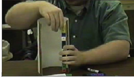
Figure 2. Dan's description of how 6000 cubes would fit in the given cylinder.

D: Ten, you should go ten from any edge. Any edge [pointing to two points on the circular border of the upper base as if those two points are the end points of the line segment representing the diameter of the base of the cylinder], you should be able to go 10 across.