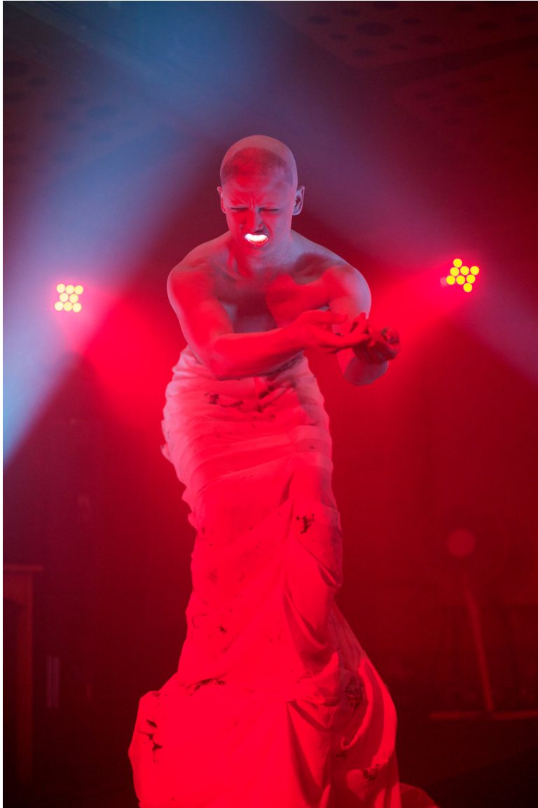
Figure 1. boychild, #untitled lipsynch 1 (2013). Arika, Episode Five: 'Hidden in Plain Sight', Stereo, Glasgow.

now, predominantly in 'high art' settings across Europe and the US. She also has a notable artistic presence online. 2 With the consumption of boychild's act having evolved from the drag scene, to the club, to arts venues, via this process of increasing institutionalisation, a sense of the work's potential as a vehicle for political statements is intimated. By recontextualising the work in an arts space, the programmers of these venues implicitly indicate that there are themes, questions, and points of contention in boychild's work that point towards a politics. One objective of this essay is to attest to that political value.