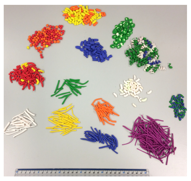
FIGURE 1. The model microbes in various colors and shapes. A 30-cm ruler is included for scale.

the mixture was cooled sufficiently, it was poured into the petri dishes that already contained the desired model microbes and left to set. If a lab and agar are unavailable, a common dessert/snack jelly or gelatin sheets available in supermarkets can be used too. This should be made up according to the manufacturers instructions. However, unlike agar, this jelly needs to be set for 24 hours in a domestic fridge to be firm enough for the activity. Once firm, the plates were sealed with PARAFILM<sup>®</sup> or packaging tape.