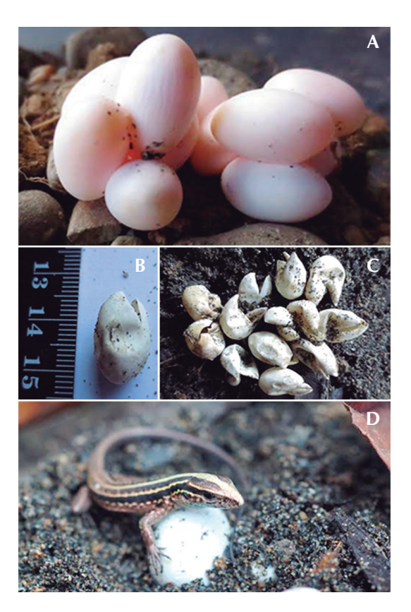
Figure 2. (A) Clutch of 13 eggs of Kentropyx altamazonica found at the MLC research station on 8 April 2014. (B) An empty egg of K. altamazonica , showing the distal exit point. (C) K. altamazonica hatchling success was 100%. (D) Newly hatched K. altamazonica .

Oviposition and hatching in Kentropyx altamazonica occurs in both dry (e.g., April) and wet (e.g., November) seasons. Likewise, hatching also occurs in wet and dry seasons (March and August, respectively). Duellman (2005) reported a female containing three oviductal eggs in December (wet season) and another female with four well-developed eggs in February (wet season). This variety of oviposition dates may suggest aseasonal reproductive cycles in K. altamazonica. Duellman (2005) reported a small clutch size of two or three eggs for K. altamazonica, whereas Werneck et al. (2009) reported larger clutch size of three to nine eggs (mean 5.45 \pm 1.11, N = 38). This latter value is more similar to the clutch we found in November (N = 6). A possible explanation for the 13 eggs found in April might be communal nesting. Communal nesting is a reproductive strategy