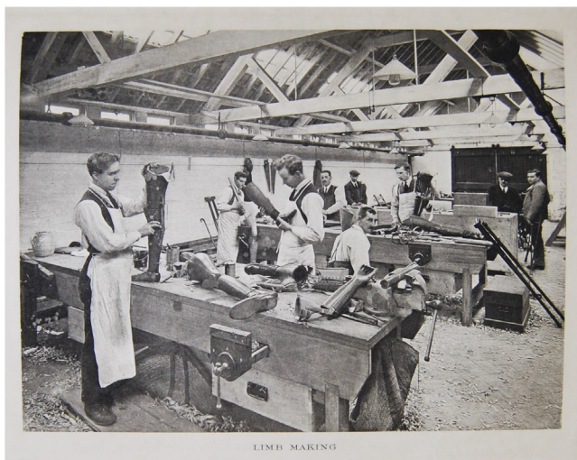
Figure 6. Limb making workshop. University of Glasgow Archives reference UGC225/10.

Workshops provided an alternative environment of healing outside of the hospital wards (Figure 7), where a disabled serviceman could learn or enhance trade skills, socialise, earn extra money, alleviate boredom, exercise muscles and get used to new prosthetics. Manual rehabilitation facilities and training programmes were conceived, designed, and constructed by medical professionals and civilian benefactors of a certain social class, who had very specific ideas of masculine socio-economic roles and how disabled servicemen should adapt (and have their maimed bodies adapted) to them. The physical and psychological benefits of work were readily apparent to hospital authorities, and many men voluntarily participated in workshop training schemes, some of whom stayed in sheltered workshop employment (either at Erskine or elsewhere) for years to come. Many more, however, did not.