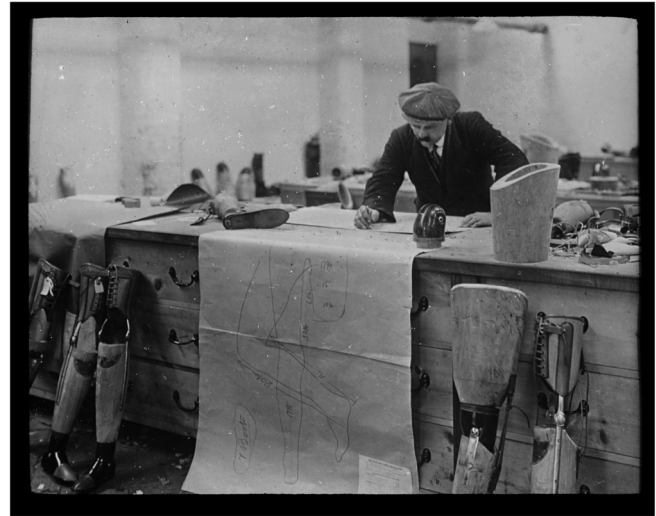
Figure 3. Designing artificial limbs. Engineers from the Clydeside shipyards were integral in the design process.

The hospital specialised in the aftercare of amputations. Re-amputating and surgically correcting previous operations was common, as attested by the operations books kept by Erskine's surgeons. Macewen and the hospital's founders fully recognised the need to provide lifelong medical care to amputees long after their stumps healed and prosthetics were fitted. In addition, the hospital actively undertook research into the improvement of prosthetic technology. Engineers from the Clydeside shipyards were integral in the ongoing design process ( Figure 3 ).