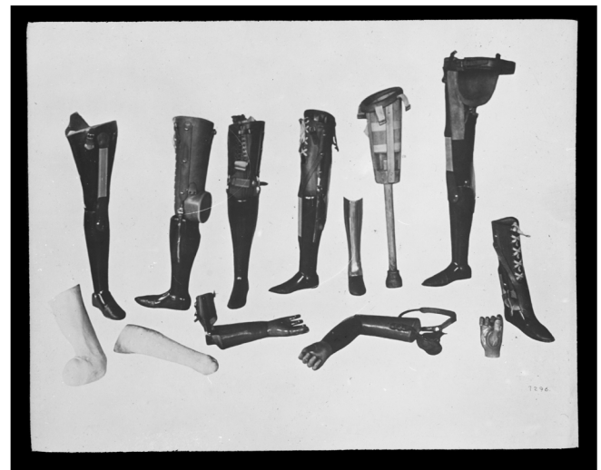
Figure 1. Examples of prosthetic limbs.

The use of occupational therapy was developing prior to the First World War alongside the growing movement to define orthopaedic surgery as a medical specialization (Perry, 2014). Doctors who