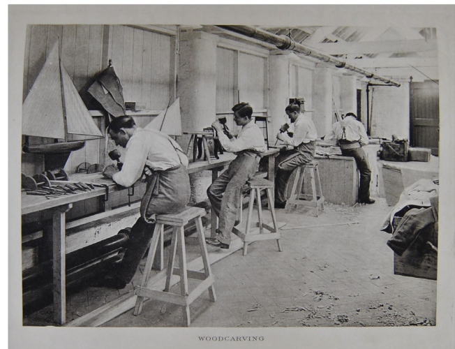
Figure 5. Woodcarving workshop. University of Glasgow Archives reference UGC225/10.

Likewise, it was attractive to contemporaries to support the hospital by purchasing items produced by the workshops. The workshops' later 1950s advertising slogan of 'help yourself by helping Erskine,' exhibits the idea of a mutually beneficial economic transaction: the purchaser gets something that they need, in addition to supporting a good cause. In the early years of the hospital, the workshops struggled to keep up with the demand for their products. Written requests for orders were routinely turned down in 1917 until