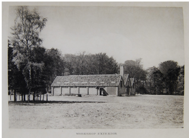
Figure 4. Workshops at Erskine converted from agricultural buildings.

of a dedicated limb making shop adjacent to general shop (30/8/1916: pp80). Agricultural courses (poultry and pig keeping, gardening, dairying) were conducted in the extensive gardens and fields on the property. Inspiration was taken from other hospitals, specifically the 'mechano-therapeutics used at the Anglo-Belgian Hospital' (27/6/1916: pp56) and other facilities on the Continent. Strong links were maintained with similar facilities throughout the UK, sharing expertise with hospitals, such as the Ulster Volunteer Force Hospital at Queen's University Belfast, Ireland.