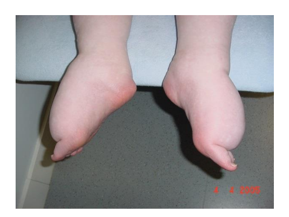
Figure 1 Bilateral foot deformity from lymphoedema

Health care professionals specialising in lymphoedema management are familiar with the concept of working within a multidisciplinary team for maximal benefit to lymphoedema patients. This team often includes Nurses, Physiotherapists (PT), Occupational Therapists (OT), Doctors and, on occasion, Social Workers, but Podiatrists and Orthotists are rarely considered. This is surprising, given that complex foot problems, including difficult decisions on the bandaging of diabetic wounds, are acknowledged in patients with lower leg chronic oedema (Chadwick 2006) (Fig 1.). The knock-on effect for joint alignment, however, is rarely discussed.