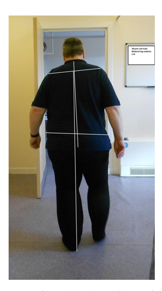
Figure 4 Left leg >Right leg volume shifts centre of gravity on walking gait

severely oedematous (fig 4), but a heavy oedematous arm can also affect balance and gait. Simple observation can establish that a swollen arm has the potential to significantly redistribute weight/balance affecting the biomechanics of other muscles and joints and therein gait, yet there is a dearth of research on this aspect. Specifically in relation to lower limb, the shift in centre of gravity can combine with difficulties in obtaining suitable footwear, in the vulnerable this can lead to an increased risk of falls. In addition these problems combine to impact on one of the most important components of lymphoedema management – exercise.