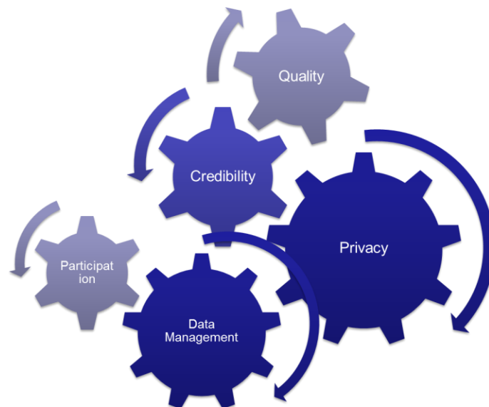
Figure 2. Different challenges in the implementation of participatory sensing actually drive and affect each other due to their intertwined nature.

The data collected by participatory sensing from a large scale of sensors and from a diverse group of participants is bound to scale very quickly into a large sized set – classified as a "big data" problem. Management of such a data set and extraction of useful information in a timely manner is a big challenge and an active area of research.