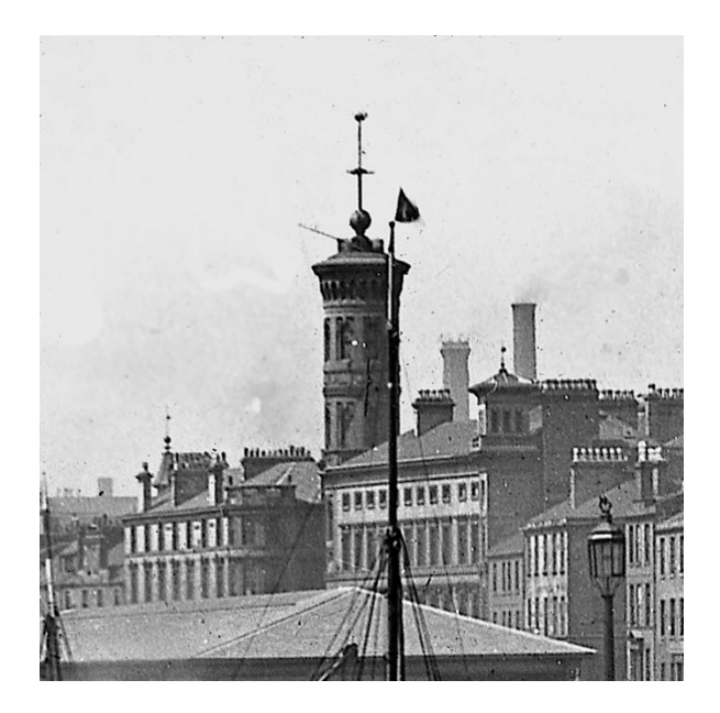
Fig. 4. The Glasgow time ball c. 1870 on top of the Sailors' Home on the Broomielaw to the left of a mast head of a tied up ship.