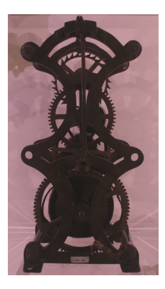
Fig. 6. The Old Glasgow College tower which housed a turret clock, the first in the City to be connected by telegraph in December, 1864 to the University Observatory at some 4 miles away. The College was demolished in 1871 but the mechanism of the clock was saved and remains on display at the entrance of the Bute Hall at Glasgow University.