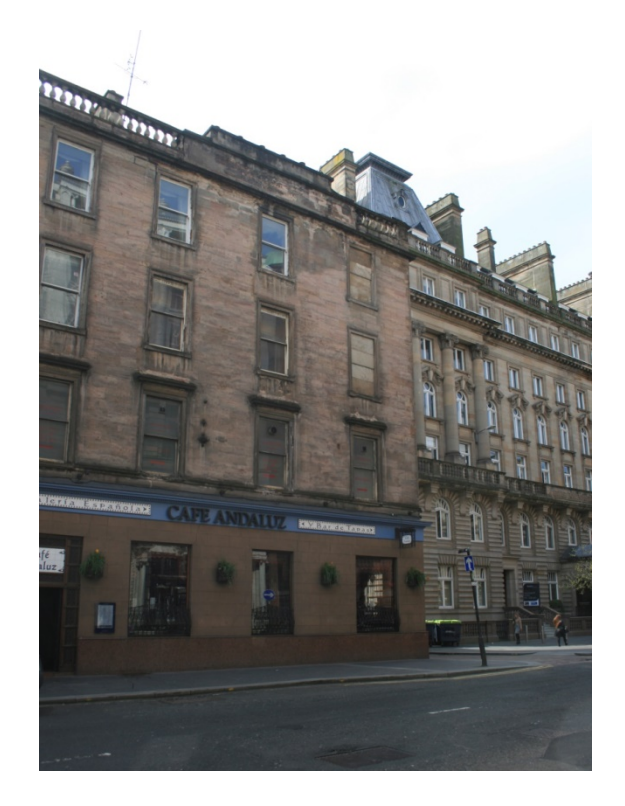
Fig. 5. The premises of 15 St Vincent Place in the city centre of Glasgow, once holding the offices of the Universal Private Telegraph Company. A time gun was placed on the roof at the end of October 1863 and used for a short period on a daily basis.

Fig. 4. The Glasgow time ball c. 1870 on top of the Sailors' Home on the Broomielaw to the left of a mast head of a tied up ship.