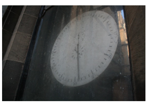
Fig. 7. The rear of the seconds' clock, originally at the the Old Glasgow College, showing a seconds' finger which is connected to a full the large sweep seconds' finger on the outer display face. The front face shows the large finger sweeping out time to the second. The mechanism and face are now housed in the West Quadrangle of Glasgow University.