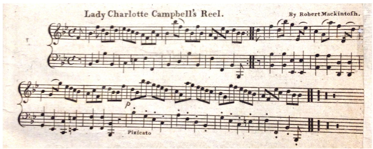
Example 5 Mackintosh n.d., p. 1: A.K. Bell Library, Perth.

Some basslines freely intersperse sections apparently intended for cello with writing including impractical octaves or close triads, much better suited for piano or perhaps harp. Some are quite baffling in their combination of keyboard and string idioms, such as this example from a single sheet by Robert Mackintosh,<sup>27</sup> which includes both keyboard left hand chords and the marking 'pizicato':