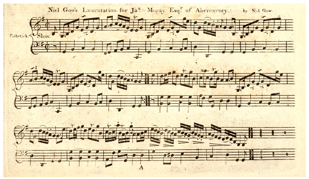
Example 9 Gow 1801, p. 3: Glasgow University Library.

Niel Gow's 'Lamentation for James Moray of Abercarney' [now Abercairney] as it appears here in the 1801 second edition of the First Book of Niel Gow's Reels , 36 was soon established as one of Gow's most famous tunes. Son Nathaniel chose it to appear as the first piece in the posthumous collection The Beauties of Niel Gow in 1819.<sup>37</sup> By then, the tune's opening anacrusis had finally acquired its now familiar gracenote and dotted rhythm, the ornamentation had been adjusted and the elegant functional bassline made a little more flowing.