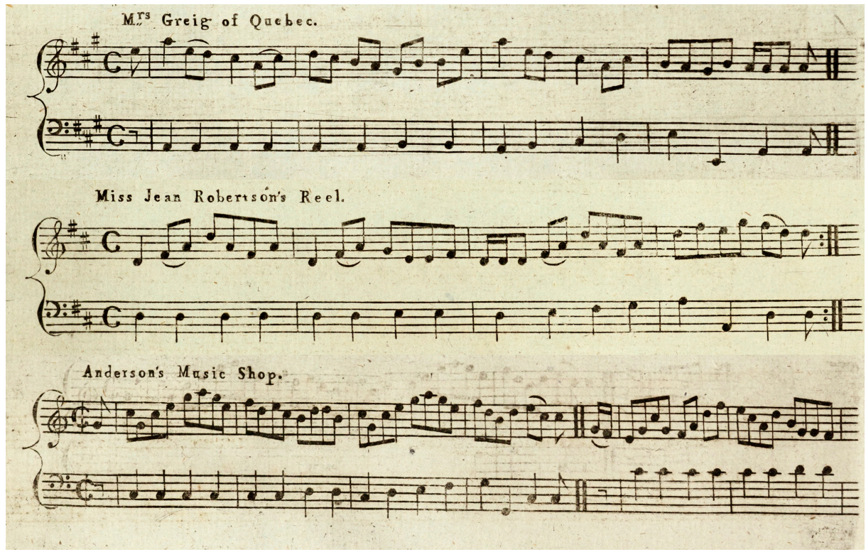
Example 4 Clark 1795, pp. 2, 7, 10: Glasgow University Library.

The piano began to appear in the instrument lists of Edinburgh music shops from around 1784,<sup>25</sup> and by the turn of the nineteenth century the type of accompaniments found in fiddle books had reflected this change, in a move from single-note basslines to triads, broken chords or octaves more suited to the pianist's left hand, and usually impossible to play on the cello as printed. The 'Piano Forte' also becomes a firm fixture on titlepages, taking over from the long-familiar formula of 'with a Bass for the Violoncello or Harpsichord'. The piano's purpose is not prescribed merely as an accompanying bass, but instead the instrument is usually promoted to principal status (as eventually is the harp): this most likely reflects a developing fashion for amateurs playing the tunes at home for pleasure, rather than for dancing.