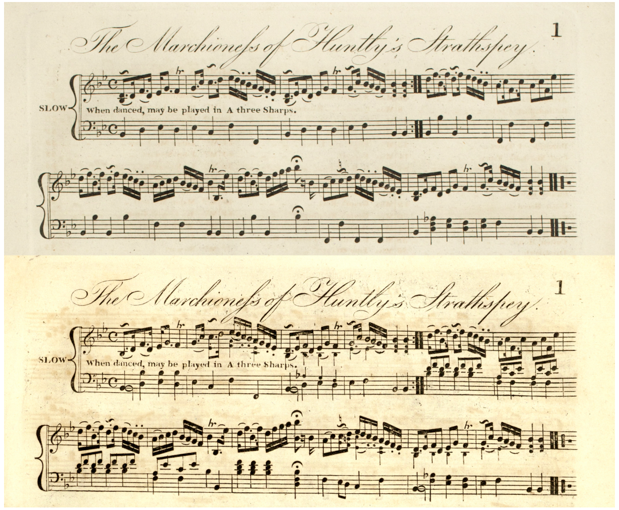
Example 14 Marshall 1822, p. 1; Marshall 1844, p. 1: Glasgow University Library.

The second edition (which is undated, but refers to the forthcoming publication of 'the whole of the remainder of Mr Marshall's compositions') used the same plates, but they were substantially altered throughout the book.<sup>45</sup> As can be seen above, the tune and ornamentation survive unscathed, but the accompaniments have been made more unashamedly pianistic: the left hand part of the beginning of the second strain seems to show a deliberate attempt to neutralise the strathspey rhythms of the tune! The harmonic content is mostly the same, other than an added brief modulation three bars