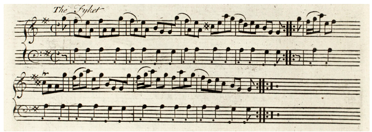
Example 2 Bremner 1757, p. 6: A.K. Bell Library, Perth.

In playing these Basses on the Harpsichord, their Octaves may be also struck, as represented by small Notes in the Fyket. page 6th.<sup>21</sup>