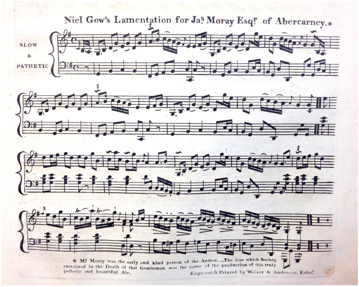
Example 10 Gow 1819, p. 1: Glasgow University Library.

The differences between these two versions are relatively subtle, and perhaps the kind of alterations one might expect an experienced player of either fiddle or piano to make on the spur of the moment. However, the 1801 version is itself the result of a substantial revision, as the book's prefatory letter 'To the Public' from Niel Gow himself makes clear: