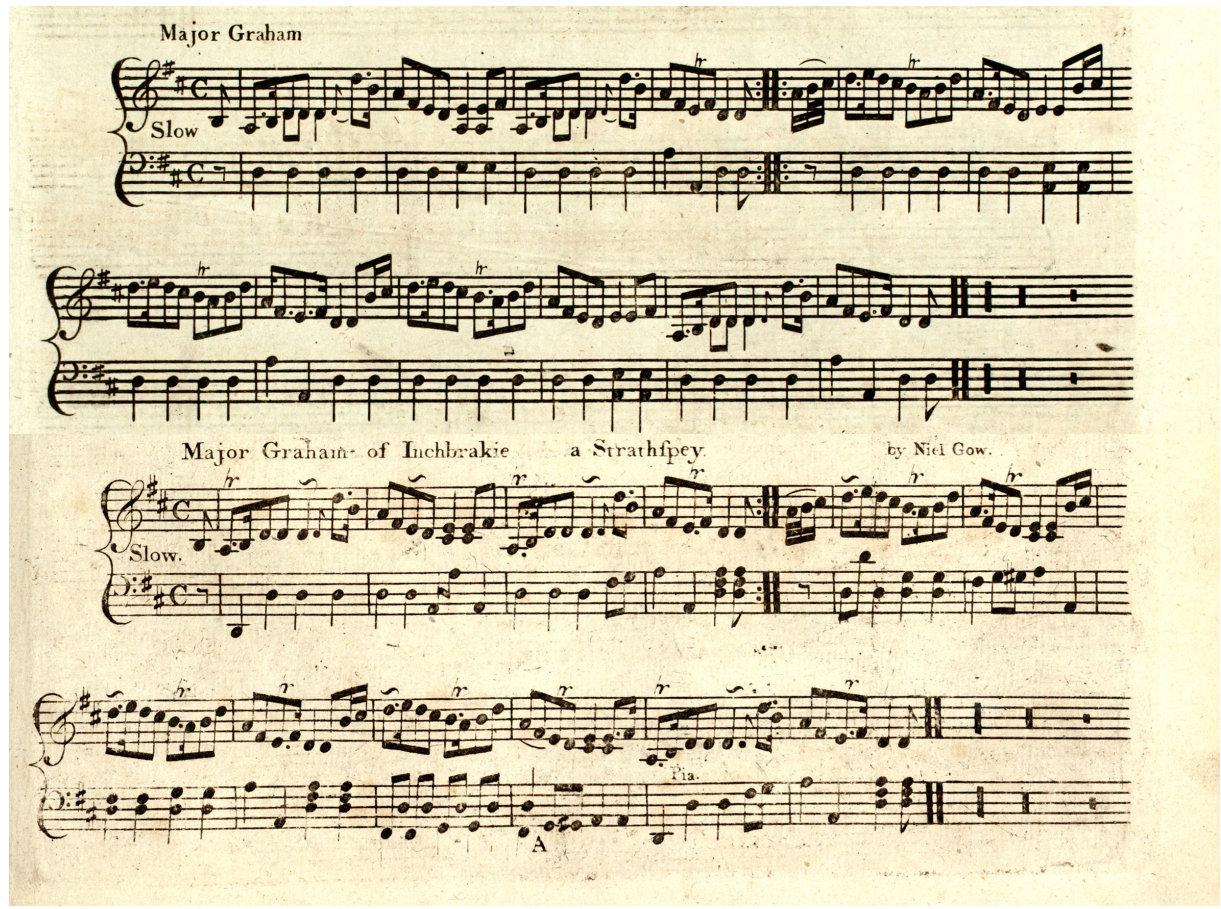
Example 12 Gow 1784, p. 6: Gow 1801, p. 5: Glasgow University Library.

The kind of changes made to the bassline are familiar from the Lament, with an added sense of direction in the line, hints of chromaticism, and some triads and broken chords. The A-E cello fifths from the first edition have not survived, and the similar fifths in the violin part have been replaced with thirds, to produce a complete tertial triadic harmony with the bass.