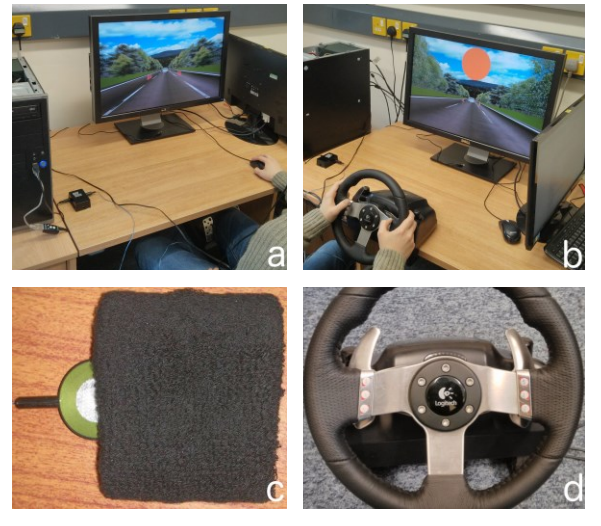
Figure 1: The setup of Experiments 1 (a) and 2 (b), the wristband with the Tactor (c) and the steering wheel used in Experiment 2, with the response buttons (d).