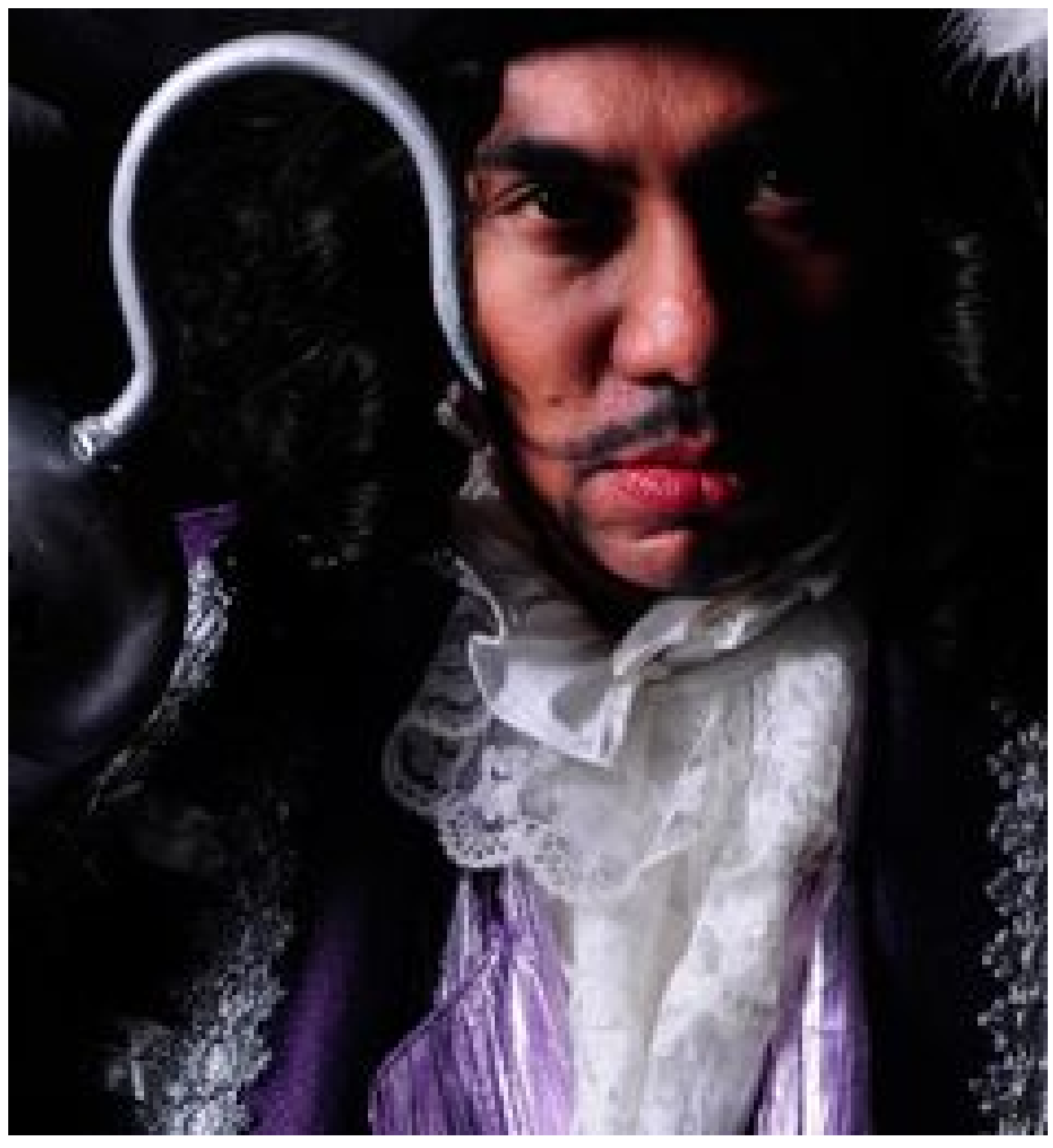
Walk the plank!