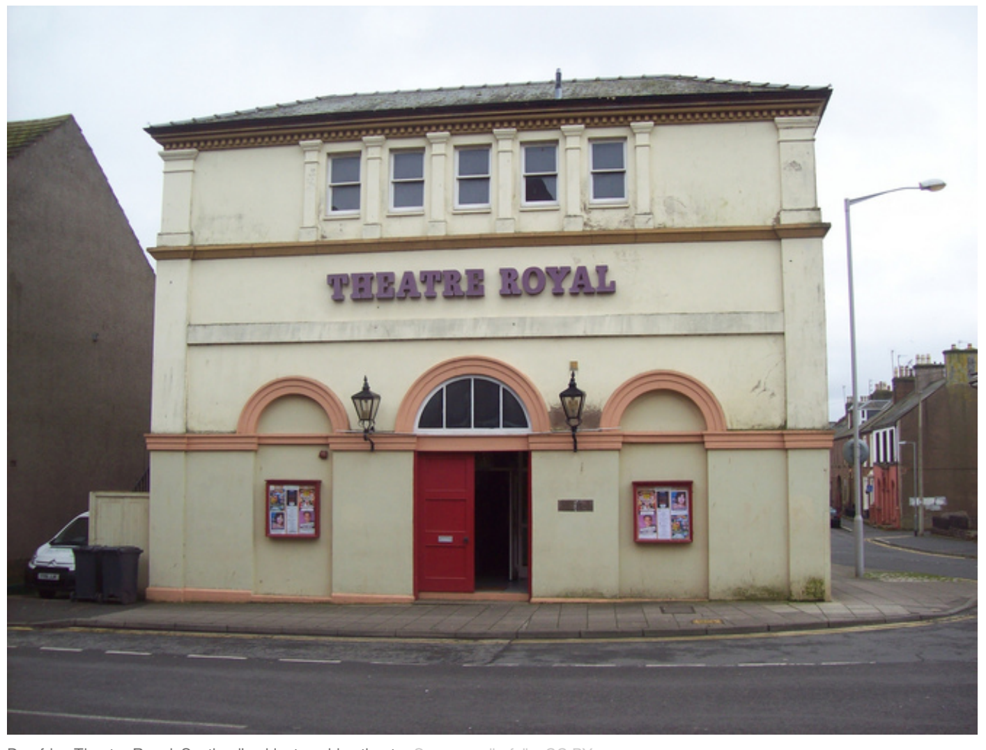
\label{thm:continuity:continuity:equation} \mbox{Dumfries Theatre Royal, Scotland's oldest working theatre}