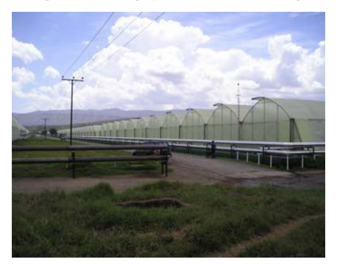
Figure 4: Geothermally heated greenhouses at Oserian (Mwangi, 2006).

Oserian Development Company owns and operates a large flower farm at Lake Naivasha (Knight et al., 2006), close to the established Olkaria geothermal power complex (Figure 4). It is the only company in Kenya to utilise geothermal energy for direct use applications on a commercial scale (Mburu, 2014) and is a prime example of using high enthalpy geothermal resources for a direct use application alongside a successful power generation operation. Since 2003, the firm has extracted geothermal fluids from an exploration well drilled by KenGen in 1983 (Mburu, 2009). The well was isolated from the main Olkaria geothermal power plant production areas, and had a very low power production potential. The geothermal fluids were initially used to heat 4 ha of greenhouses, and following the scheme's initial success, a second nearby exploration well was installed with a 1.2 MW<sub>e</sub> binary generation plant, which provides electricity alongside additional heated fluid to the farm (Knight et al., 2006). By 2010, Oserian Development Company had invested heavily into its geothermal utilisation efforts (Mariita, 2010) which included the two geothermal power plants installed and operated by the company as well as the direct use component.