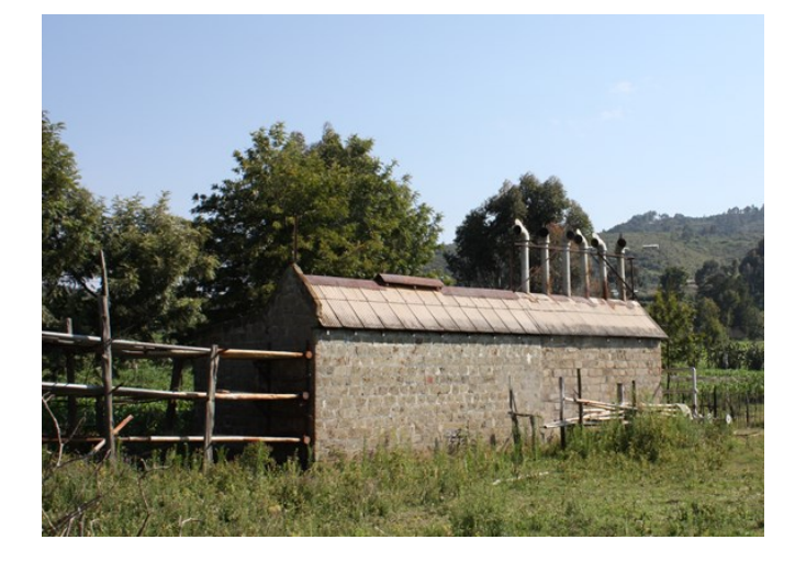
Figure 5: Community scale direct use agricultural drier near Eburru, Kenya.

It is clear that a large number of agricultural and industrial sectors in East Africa could make use of direct geothermal heat: the dairy industry, brewers, large scale food preparation, the tanning and curing industries, covered horticulture and floriculture, and crop drying to name a few. Where geothermal resources are accessible at the surface communities are quick to exploit them (see Figure 5). However, robust data on the scale of the current heat use are not easily accessible.