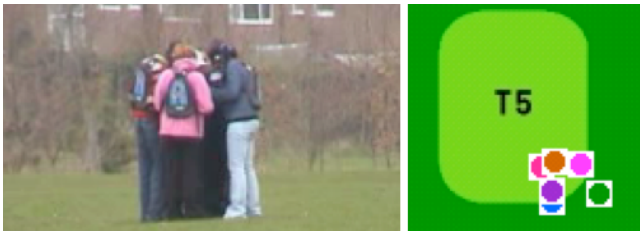
Figure 3. Exploiting video and system replay to understand interaction in Savannah.

For Savannah we developed a dedicated game replay interface, which enabled the analyst to view the system logs in a range of ways [6]. A bird's eye view of the virtual savannah showed the positions of content such as animals (specified as discretely bounded colored regions called locales) and also the moment-by-moment positions of the six lions (as reported by GPS). This could also be overlaid with the positions of key past and future events such as 'attacks' and representations of the trails of different lions. Complete game status information was displayed for all players, including hunger, thirst and attack events. It was also possible to view what a selected player would have been seeing and hearing via their PDA at a given moment in time.