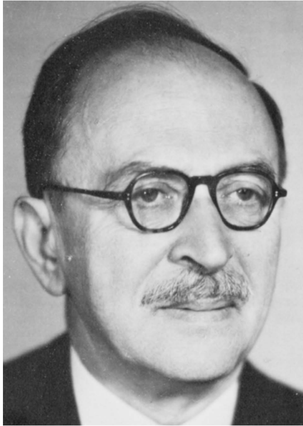
Fig. 1. Dennis Gabor (1900–1979) in middle age.