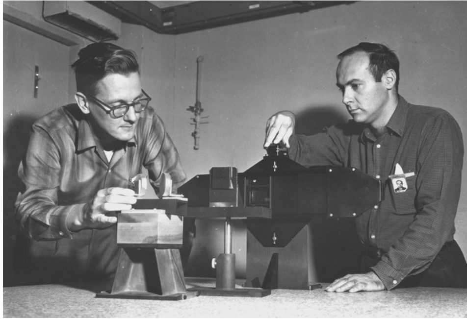
Fig. 3. Juris Upatnieks (b. 1936, left ) and Emmett Leith (1927–2005) in 1963.

first four months of 1964 produced a true explosion of attention. This publicity redefined the content of their new technology. Its origins in Synthetic Aperture Radar were hidden. Instead, their technique was trumpeted in a press release by the American Institute of Physics (AIP) as “lensless photography,” which created a new perception of its history, concepts, and future.