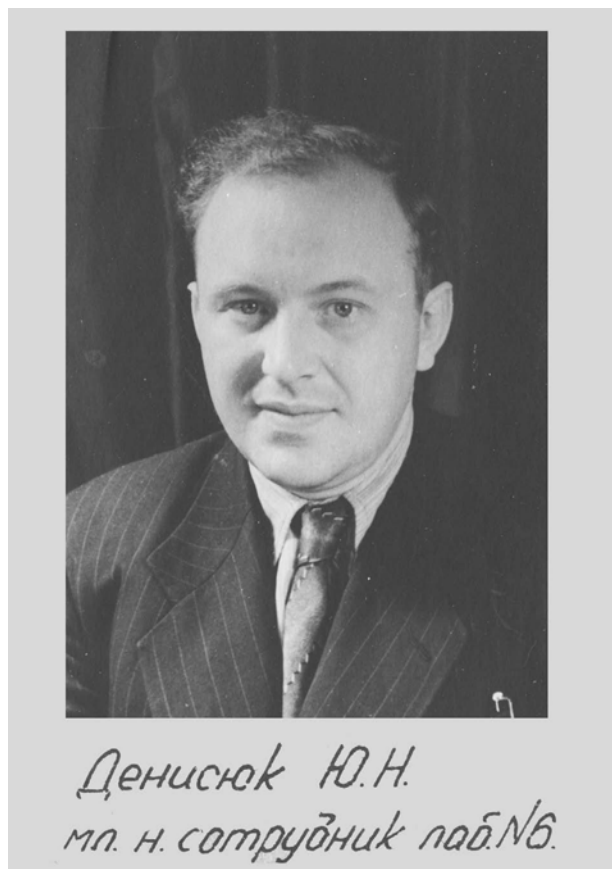
Fig. 2. Yury Denisjuk (b. 1927) around 1966.

lens traveled through the emulsion, was reflected by the mercury mirror, and traveled back through the emulsion, setting up a standing wave in the emulsion for each of the wavelengths of the incident light and thus producing an interference pattern in the emulsion. Recording this interference pattern with monochromatic film, the emulsion simultaneously produced a photographic image – darkening where the light was intense – and acted as a color filter, because each standing wave in the emulsion corresponded to a single wavelength. The result was a full-color rendition of the original image, reflecting the full spectrum of wavelengths in the light source (at least so far as the emulsion was sensitive to those wavelengths).